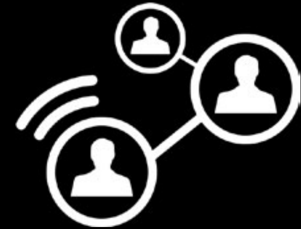
LinkedIn 1900 Members