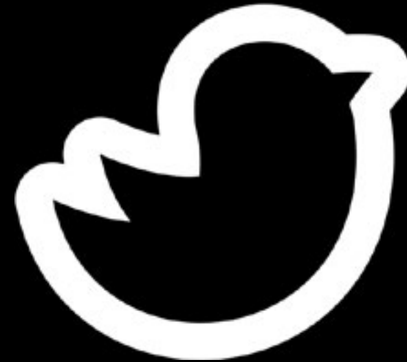
Twitter 13,000 Followers