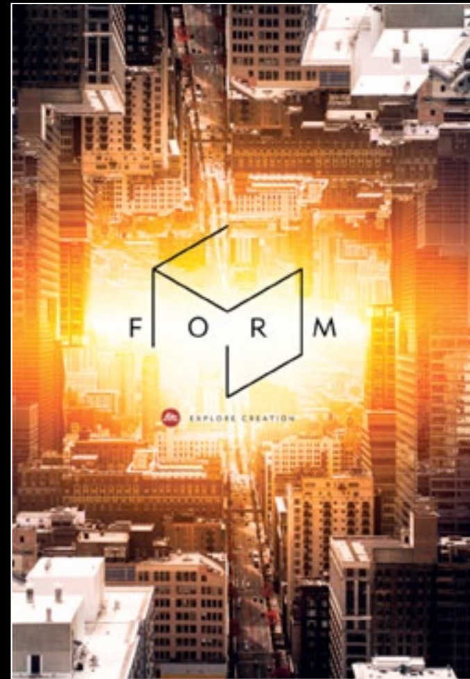
FITC FORM CHICAGO