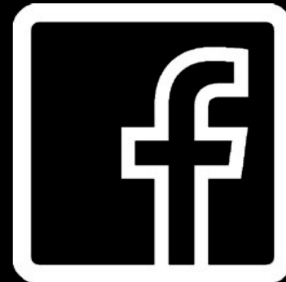
Facebook 10,500 Followers