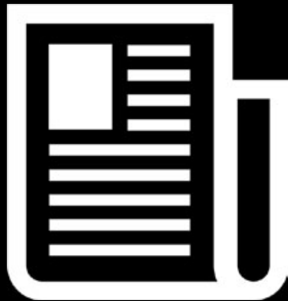
Dedicated Email Blast 12,000 Names/Emails