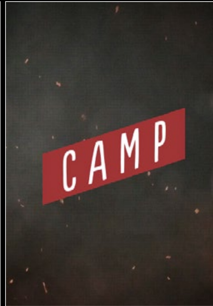
CAMP Festival CALGARY