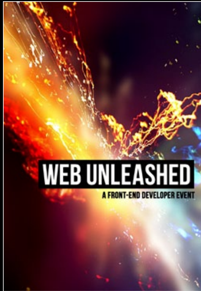
FITC Web Unleashed TORONTO